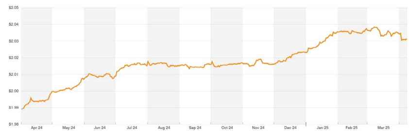
DAILY ASKING RENT PSF