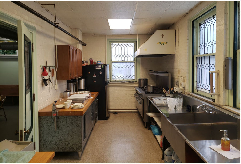
INTERIOR PHOTOS 125 NORTH MAIN STREET, PITTSBURGH PA, 15215 | ALLEGHENY COUNTY