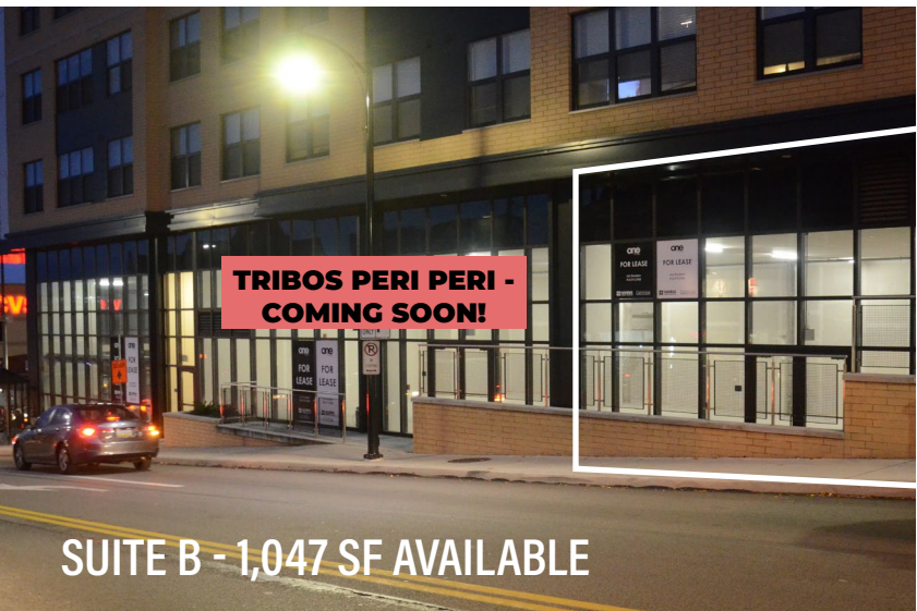
SUITE B - 1,047 SF AVAILABLE